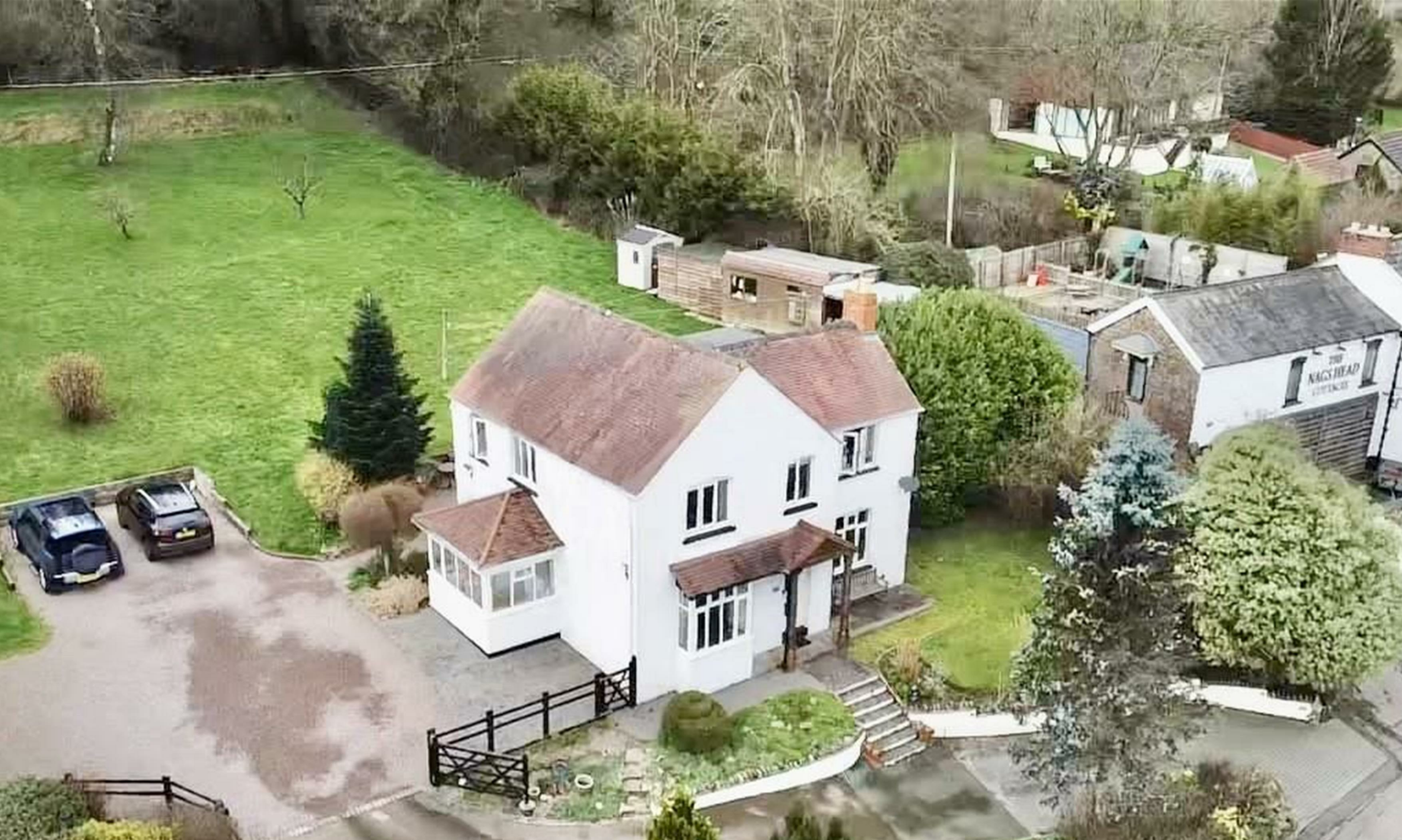
The Dials Ross Road , Longhope, GL17 0LW £625,000